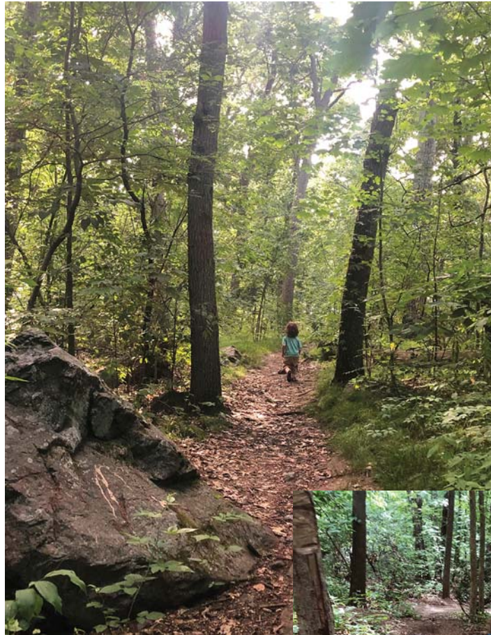
walking trail and mountain bike trail in the Crusher Lot

Did you know there's a proposal to transform it into a mountain bike park?